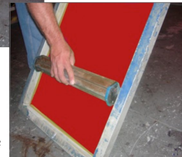
Step 2. Squeegee Side